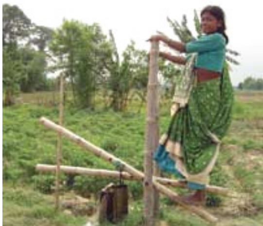
A woman operates a bamboo treadle pump in Nepal.

In countries which are affected by drought, like Zambia, it is important for people to be able to produce food all year round. To do this they have introduced technologies to make the best use of available water resources. A very simple and inexpensive water lifting device that is used there is the treadle pump. This has made millions of the world's poorest farmers in developing countries double their incomes. By using this device, farmers in these countries are able to harvest a second or third crop in the dry season as well as plant new varieties of vegetables. In some cases, crops are being grown where nothing grew before.